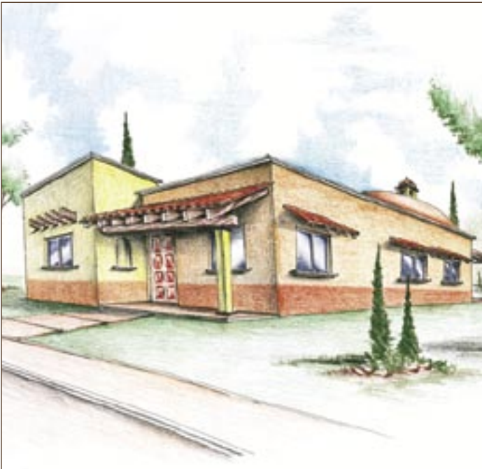
Option 1 - This single-story home includes 2 bedrooms and 2 baths

We have 11 apartment buildings with six condominiums in each, two per floor for privacy. Elevators specifically designed for the handicapped are available in each building. There are 3 categories of condominiums. The Senorial and Real have an area of 1047 square feet and include 2 bedrooms, 2 baths, a garage and a storage room. The Real apartment is located on the third floor and has traditional Mexican ceilings with cupulas . The Imperial apartment has the same square footage plus a private terrace and garden.