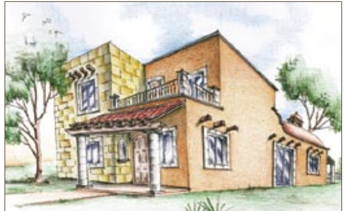
Option 2A - This two-story home includes 2 bedrooms and 2 baths on the ground floor while the upper floor includes 1 bedroom, 2 baths, TV room and studio.